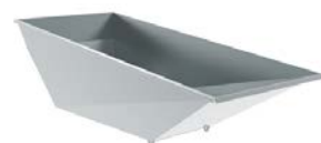
Galvanized skip 300 L (10.6 cubic ft.) A015.800