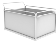
Platform 885x1250xh620 mm (34.8" x 49.2" x 24.4") A031.720