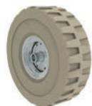
Heavy duty axles + non marking wheels upgrade (1000 kg) (2,204 lbs.) load DR214.114-8

Upgrade to 50/70A AGM batteries DB096.070