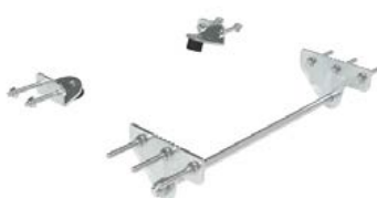
Complete fitting kit A403.701