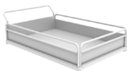
Platform 885x1250xh230 mm (34.8" x 49.2" x 9") A031.700