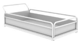
Platform 695x1250xh230 mm (27.4 x 49.2 x 9") A030.700