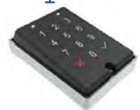
On/off keypad E506.750