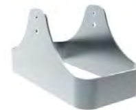
Rear wheel guard Z323.710