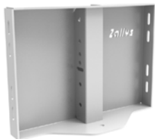
Adjustable connection for hitches