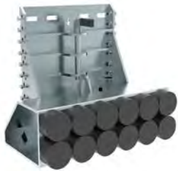
Pushing block A161.700