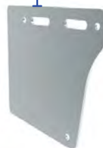
17,5 kg (38.6 lbs.) side ballasts (max 20 pcs.)