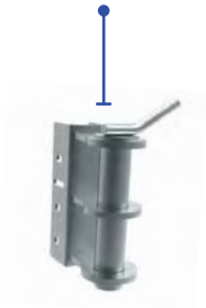
Drop pin Ø40 mm (1.58") A199.706