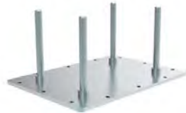
Fitting kit for ballast