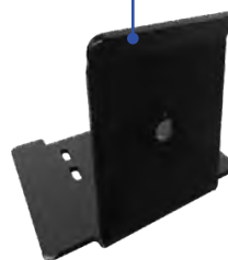
Fitting kit for battery pack Z524.712