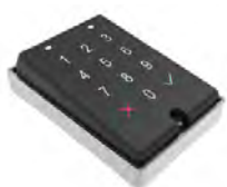
On/off keypad E506.750