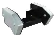
Ballasts kit (54,5 kg) Z524.720 120 lbs.