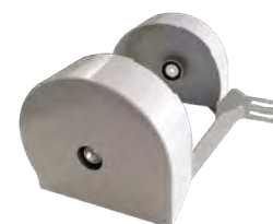
Pivoting connection ZG10.021.720