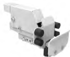
Electric controlled hitch ZG20.032.721