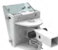
Pivoting connection ZG10.021.720