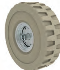
Upgrade to non-marking wheels (2 wheels) DR209.112-2