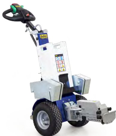
M12 E + Electric controlled hitch (ZG10.021.720)