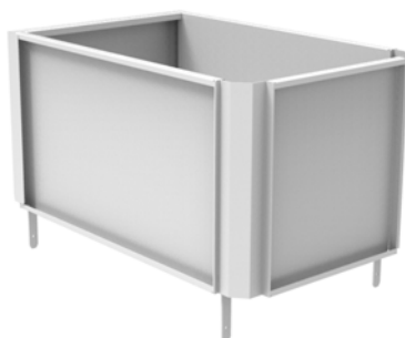
Removable cage - sides h560 mm (22") Z175.751