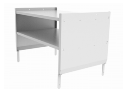
Extra shelf kit Z175.752