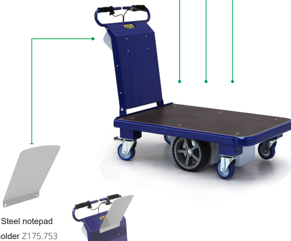
Steel notepad holder Z175.753