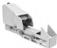
Electric controlled hitch ZG40.024.700-1