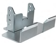
Roll box hitch (50x50) ZG60.026.700 (2" X 2")