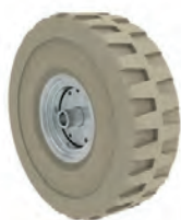
Upgrade to non-marking wheels (3) DR212.112-3

Upgrade to 50/70A AGM batteries DB096.070