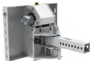
Electric controlled tilting arm ZG60.021.730