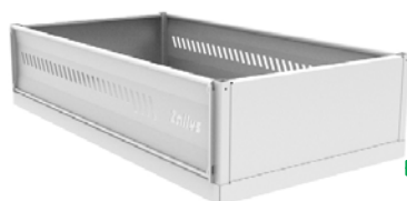
Platform 800x1500xh300 mm (31.5" x 59" x 11.8") A033.700