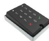
On/off keypad E506.750