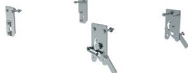
Standard fitting kit A405.700