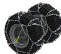
TURF TYRES + SNOW CHAINS KIT