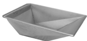
GALVANIZED SKIP 180 L