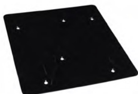
BOTTOM SKIP REINFORCE