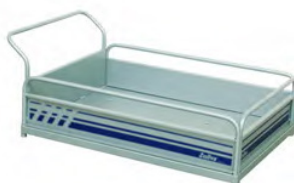
PLATFORM 750X1020XH230 MM