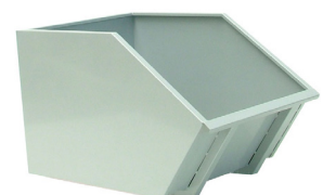
PAINTED SKIP 500 L