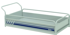
PLATFORM 885X1250XH230 MM