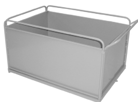
PLATFORM 800X1250XH630 MM