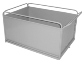
PLATFORM 800X1250XH630 MM