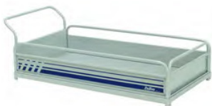
PLATFORM 695X1250XH230 MM