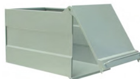
PLATFORM 700 L