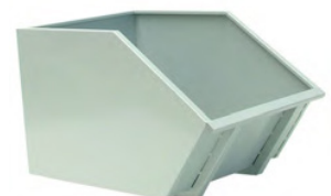
PAINTED SKIP 500 L