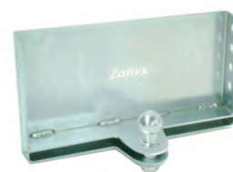
TOWBALL TRAILER HITCH