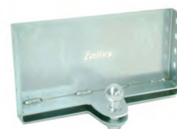
TOWBALL TRAILER HITCH