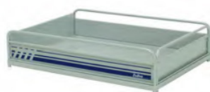
PLATFORM 885X1250XH230 MM