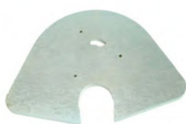
8 KG BALLASTS