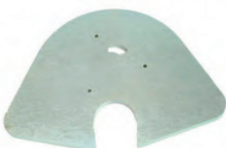
8 KG BALLASTS