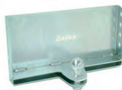
TOWBALL TRAILER HITCH