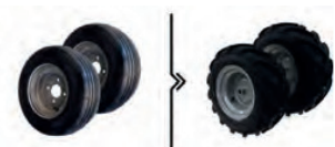
TRACTOR WHEELS (2 WHEELS)