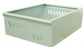
BASKET 730X500XH220 MM