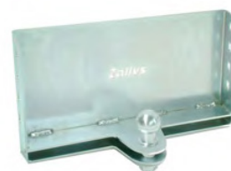
TOWBALL TRAILER HITCH