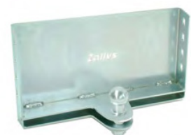
TOWBALL TRAILER HITCH