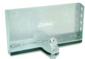
TOWBALL TRAILER HITCH