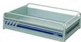
PLATFORM 750X1020XH230 MM