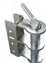
DROP PIN Ø38 MM