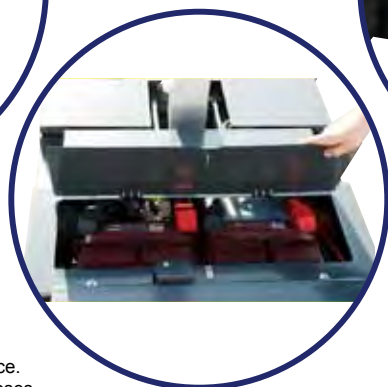
Integral fork pockets