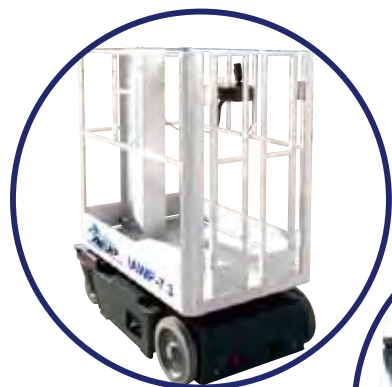
Compact & Powerful