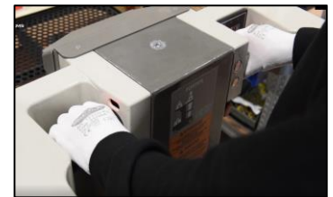
DUAL FOOT AND HAND SENSORS