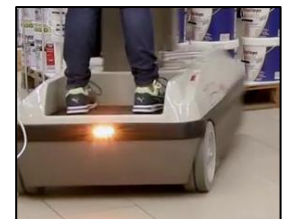
FRONT & REAR TRAVEL LIGHTS

MAKING WORK SAFER, FASTER, EASIER... MORE PRODUCTIVE