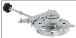
360° Platform Rotation- XT510