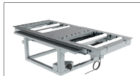
Electric Controlled Sliding Platform