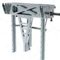
Side Coffin Lift System A212.700