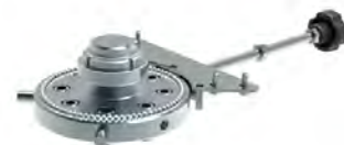
Rotating platform system A210.710