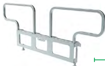
Side parapet A210.720