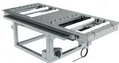
Electric controlled sliding platform A210.700