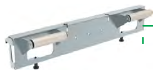
Side connection for motorized roller A210.740