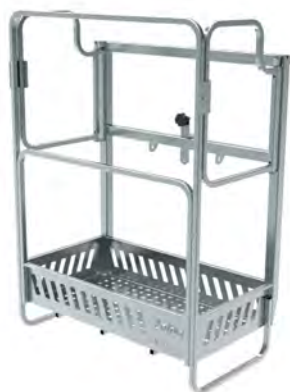
Lifting cage A211.700

Upgrade to 50/70A AGM batteries DB096.070