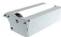
Motorized roller A213.700