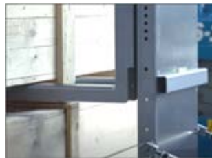
E-Z Climber w/ Fork Accessory Kit