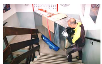
Transporting Heavy Loads Up & Down Stairs / Slopes

DESIGNED FOR BOTH INDOOR AND OUTDOOR APPLICATIONS