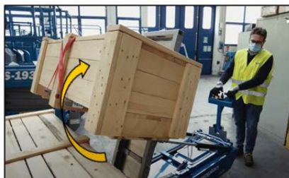
Fork Carriage Vertical Rotation - 90 degrees