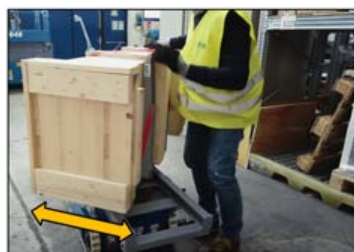
Fork Carriage Horizontal Rotation - 360 degrees